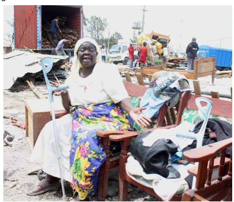
Figure 3:Mukuru demolition victim (70), once landlord turned homeless beggar.

Officials (the Code of Conduct) and the United Nations Basic Principles on the Use of Force and Firearms by Law Enforcement Officials (The Basic Principles). Both place strict limitations on the use of force. Principle 4 of the Basic Principles states: "Law enforcement officials, in carrying out their duty, shall, as far as possible, apply non-violent means before resorting to the use of force and firearms. They may use force and firearms only if other means remain ineffective or without any promise of achieving the intended result." The force used to carry out the evictions, including teargas spray, firearms and the illtreatment of men, women and children, clearly contravene Principle 4.